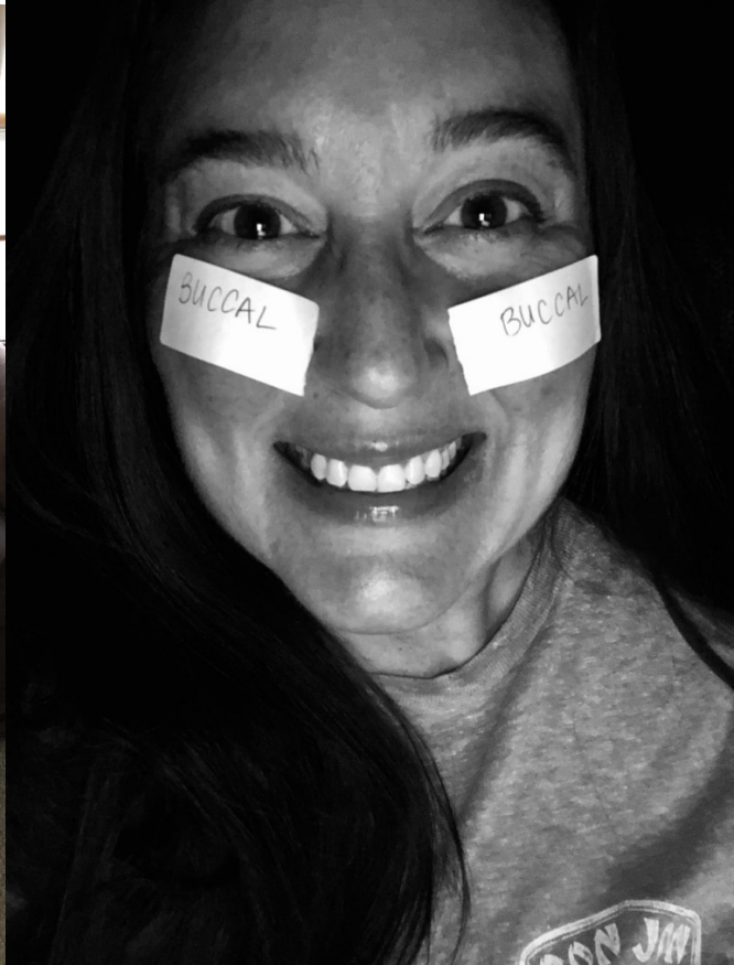
Anatomical Position Example